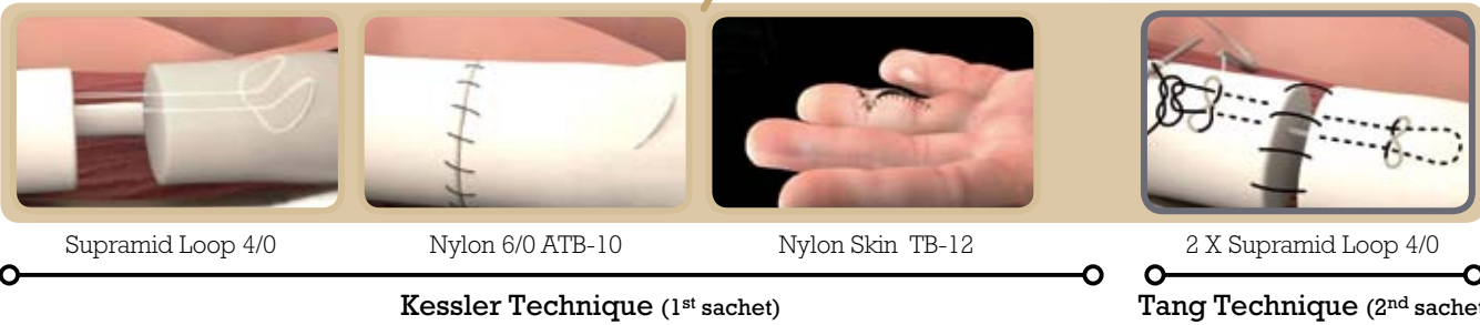
Supramid Loop 4/0